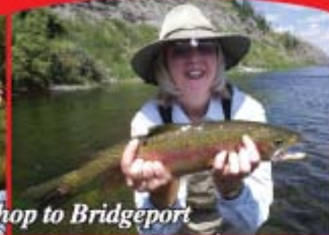
Eastern Sierra - Bishop to Bridgeport